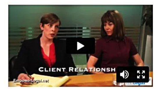
Deposition Preparation Video